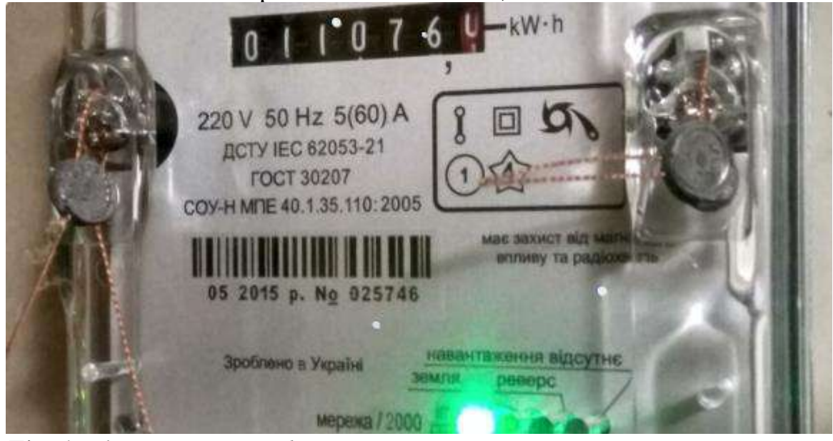
Fig. 1. Electric meter readings

Exercise 5. For 80% of the population of Ukraine, the electricity tariff from October 1, 2021 will be UAH 1.44 per kWh, subject to consumption of up to 250 kWh per month. For all those who consume more than 250 kWh per month, the price will remain the same - UAH 1.68 for the entire consumption. Until January 1, 2021, the following tariff was in force: electricity consumption up to 100 kW * h / month - UAH 0.9 per 1 kW, over 100 kW * h / month – UAH 1.68 per 1 kW. Figure 1 shows an electric meter with readings as of December 1, 2021. The previous figure as of November 1, 2021 was 10,716 kW. Calculate: a) how many kW the family consumed in November; b) how much should be paid as of December 1, 2021? c) how much would have to be paid as of December 1, 2020?