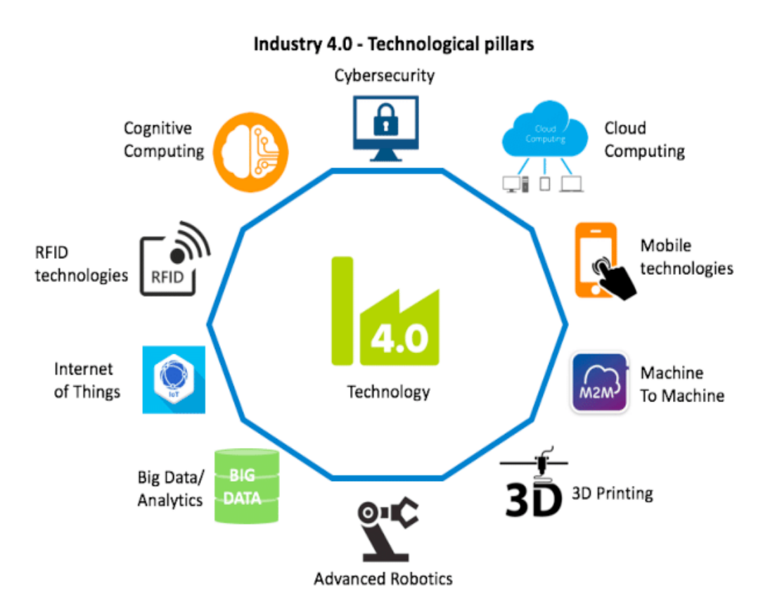
Fig. 1. Industry 4.0 technologies

When considering possible areas of innovation for industrial enterprises located in old industrial regions, Industry 4.0 projects should be highlighted (Figure 1).