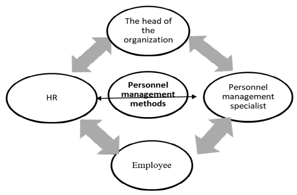
Fig. 1. Relationship of personnel management methods [19]

The application of personnel management methods depends on the established norms and values of the workforce, as well as on the goals of the organization (Fig. 1). Thus, personnel management methods contribute to the implementation of the entire complex of works related to the effective management of the organization [19].