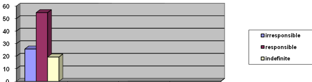
Figure 5. The teachers' estimation level of responsible attitude forming to the profession in the students of higher pedagogical educational establishments (controlled experiment)

The results are presented in the diagram (Figure 5):