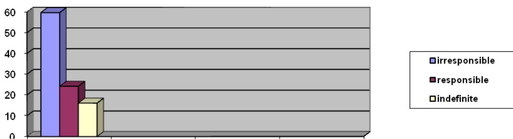
Figure 2. The teachers' estimation level of the formation of responsible attitude to the profession in the students of higher pedagogical educational establishments (stating experiment)

The results are presented here diagrammatically (Figure 2):