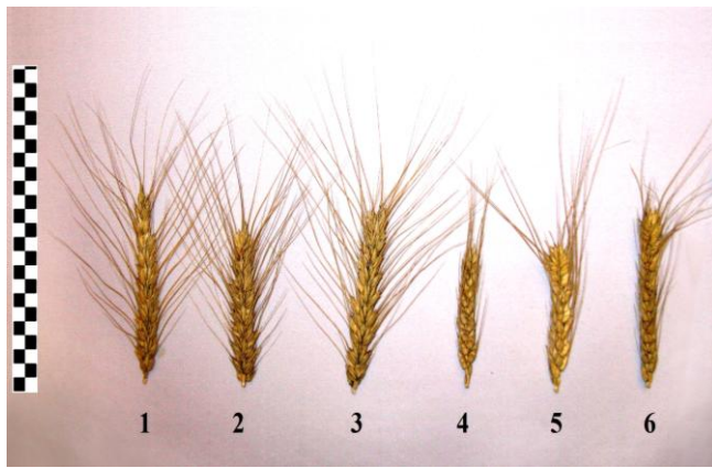
Fig. 1. Mutants according to Al'batros odes'kyi spike morphology: 1 – initial form; 2 – short spike; 3 – cylindrical spike; 4 – dense spike; 5,6 – square-headed spike