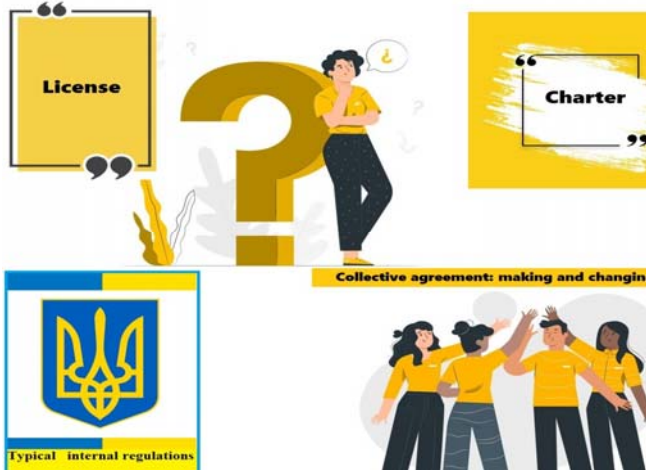
Fig. 3 Define the concept that is coded in the cross sense

Task: find the associative connection between the pictures. Determine what the task will be. (See Figure 3.)