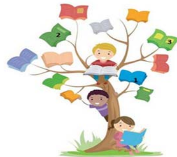
Fig. 7. There are the fruit-questions on it.

In front of you is the “Tree of Knowledge”. (See Figure VI).