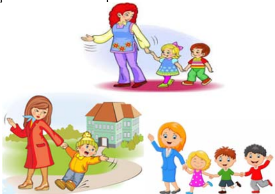
Fig. 4. I - Formation of the basics of social adaptation and life competence of the child:

II – Formation of the basics of the child's life competence: (see Fig.4)