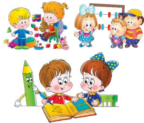
Fig. 5. III – nurturing elements of a nature-oriented worldview: (see Fig. V)

II – Formation of the basics of the child's life competence: (see Fig.4)