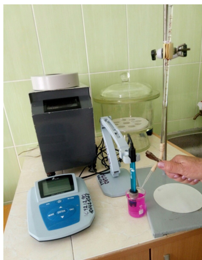
Fig. 3. Laboratory pH meter, model MP511