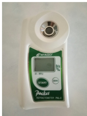
Fig. 1. PAL-3 refractometer (Japan)

In fresh raw materials and canned processing products, the mass fraction of dry soluble substances (DSS) according to DSTU ISO 2173:2007 [13] was determined using a laboratory refractometer ( Fig. 1 ), sugars according to DSTU 4954:2008 [14] using a spectrophotometer ( Fig. 2 ), titratable acidity in terms of malic acid according to DSTU 4957:2008 (GOST ISO 750) [15], active acidity according to DSTU 6045: 2008 in units of pH (DSTU ISO 1842) [16] m ( Fig. 3 ), the content of ascorbic acid in accordance with GOST 24556-89 (DSTU ISO 6557-2) [17] using a spectrophotometer ( Fig. 2 ).